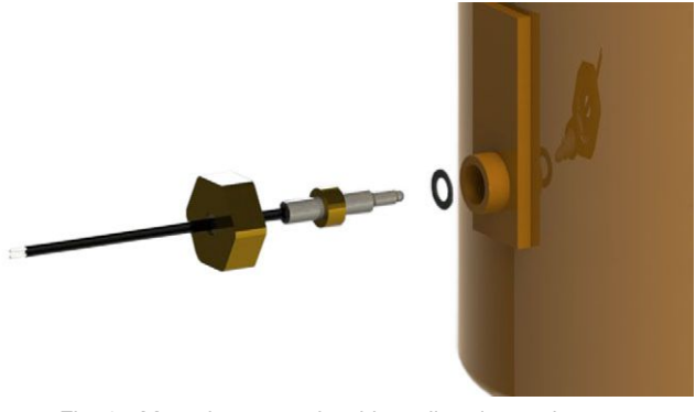
Fig. 1 - Mounting example with sealing ring and screw

\bullet\, Other R_{25} values and tolerances available upon request