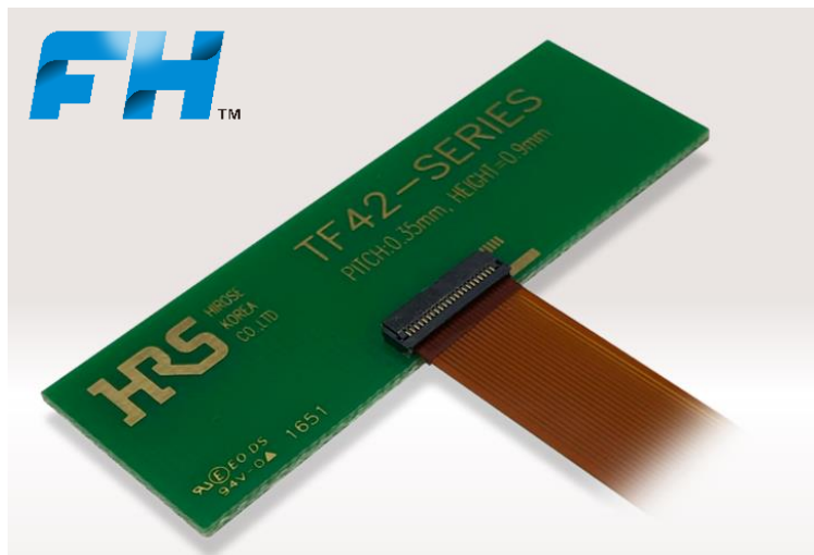
FH Flip-Lock Pioneer Hirose