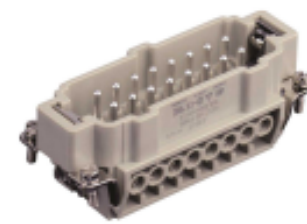
TE Part #T2040322101-000 HE-016-M 17-32