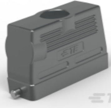
TE Part #T1340240132-000 H24B-TGH-RO-M32