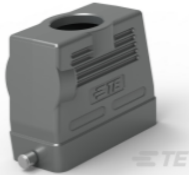
TE Part #T1340160125-000 H16B-TGH-RO-M25