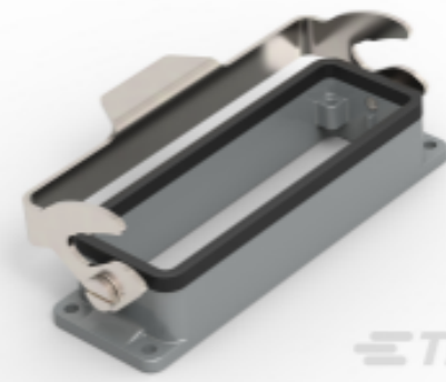
TE Part #T1500243000-000 H24B-AG-LB