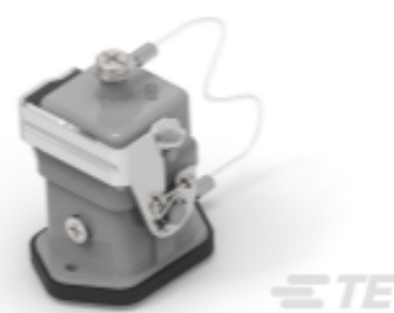
TE Part #T2120082201-100 ZGG-8D (1-2 / 4-5 / 7-8)