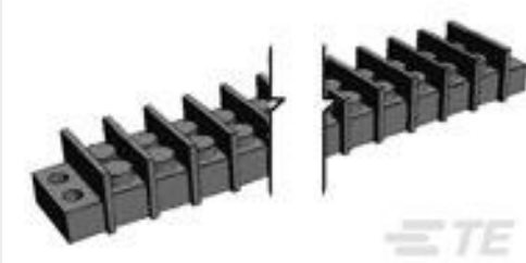
TE Part #3-1546306-0 30P.374" DR BARRIER STRIP