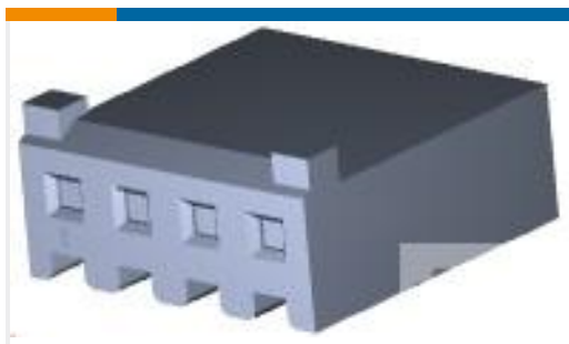
TE Part #647402-4 04P SL156 HSG W/RMP&TABS,OVSZ