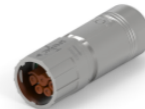
TE Part #HSA002N00420100000 723 HTEC PLUG, SPEEDTEC