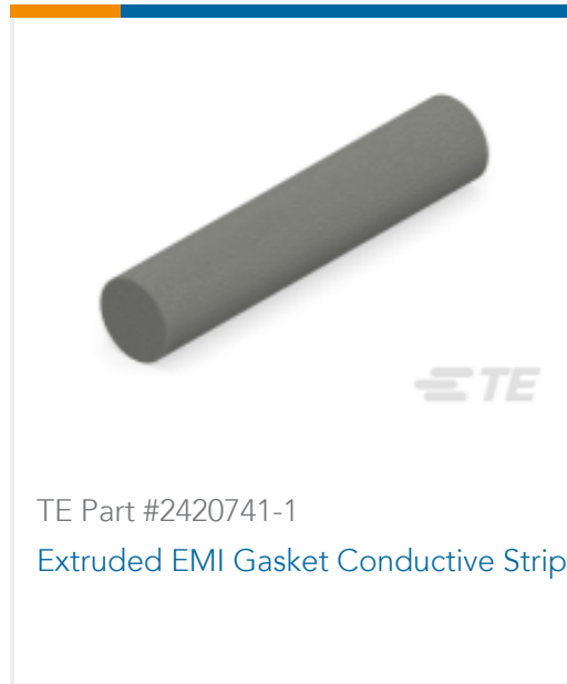
TE Part #2420741-1 Extruded EMI Gasket Conductive Strip