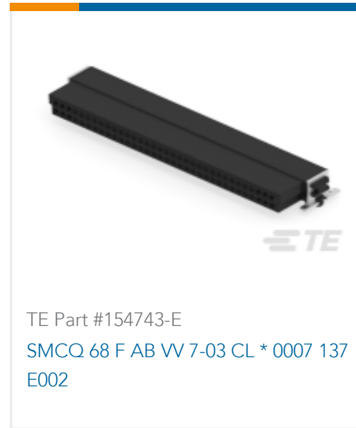
TE Part #154743-E SMCQ 68 F AB VV 7-03 CL * 0007 137 E002