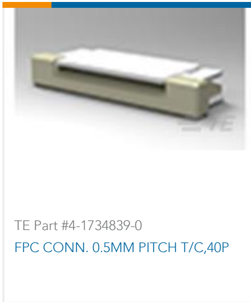
TE Part #4-1734839-0 FPC CONN. 0.5MM PITCH T/C,40P