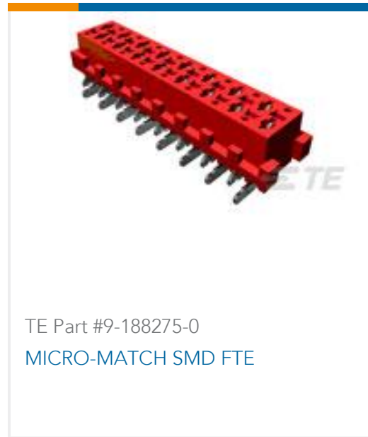
TE Part #9-188275-0 MICRO-MATCH SMD FTE