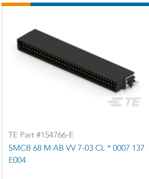
TE Part #154766-E SMCB 68 M AB VV 7-03 CL * 0007 137 E004