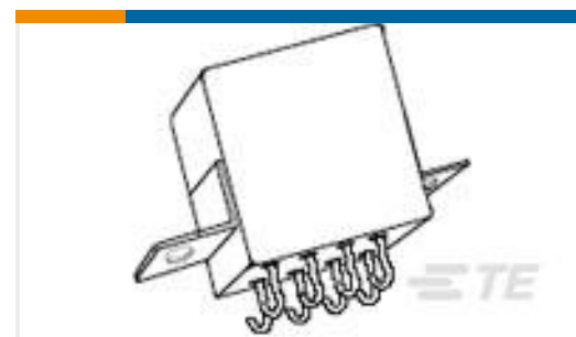
TE Part #9-1617751-9 FCA-210-CX4