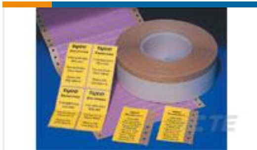
TE Part #667610-000 NPVF050WE-100