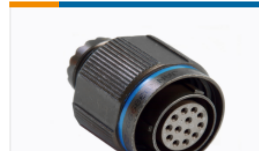
TE Part #YDTS26F11-98PNV001 PLUG ASSY