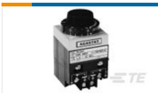
TE Part #1423159-6 7012NF=RLY,STD,ON,2P,48VDC,10