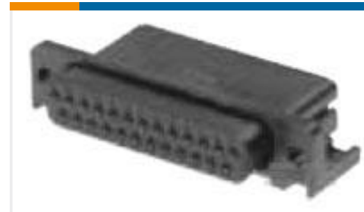
TE Part #5747460-3 HD-20 RCPT 15P RA 590 THD INS