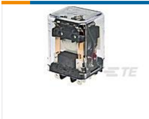
TE Part #1-1393114-1 KUEP-7D15-24=KU