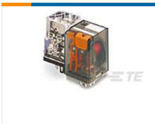
TE Part #3-1393104-6 KRPA-11AY-120=KRPA