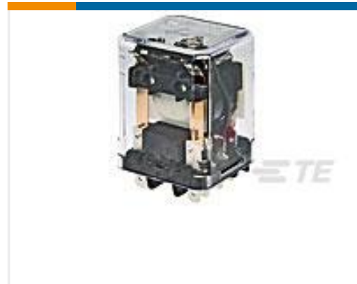
TE Part #8-1393113-7 KUEP-11D15-24=KU-