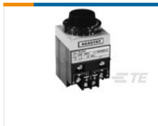
TE Part #2-1423159-3 7012PC=RLY,STD,ON,2P,125VDC,15