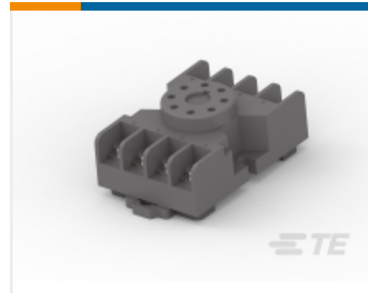
TE Part #2-1419106-3 27E891=SOCKET,KRPA,8,OCTAL,POL