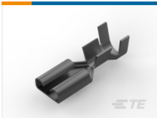
TE Part # 281197-2 FF 187 REC 1.0-2.5MM2 PTBR