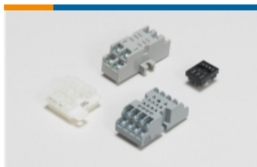
Relay Accessories, Sockets & Clips(12)