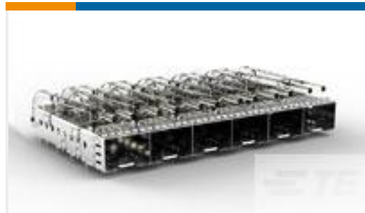
TE Part #2007250-1 SFP+ 1x6 Cage Assembly with Light Pipes