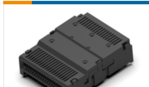
TE Part #2318579-2 RCPT CONN R/A SMT 76 POSN QSFP-DD WSHRS