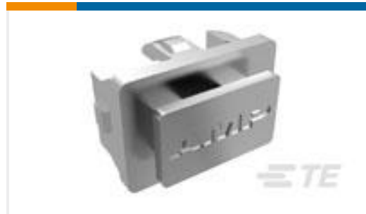
TE Part #1367147-1 SFP COVER, UNPLATED