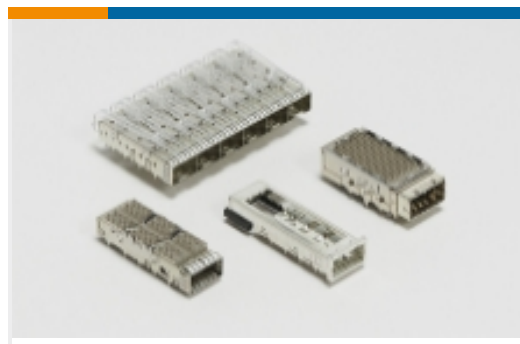
Pluggable IO Connectors & Cages(36)