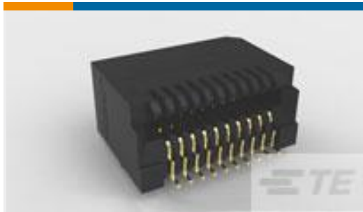
TE Part #1888247-2 20 POS SMT CONN, SFP/SFP+, 15A