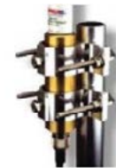
FM2 Mounting Kit (Sold separately)