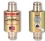
Lightning Arrestor LABH350NN (Sold Separately)