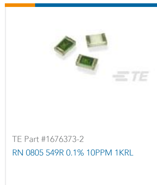
TE Part #1676373-2 RN 0805 549R 0.1% 10PPM 1KRL