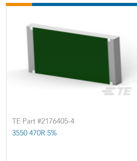
TE Part #2176405-4 3550 470R 5%