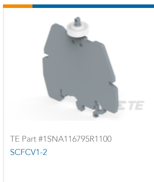
TE Part #1SNA116795R1100 SCFCV1-2