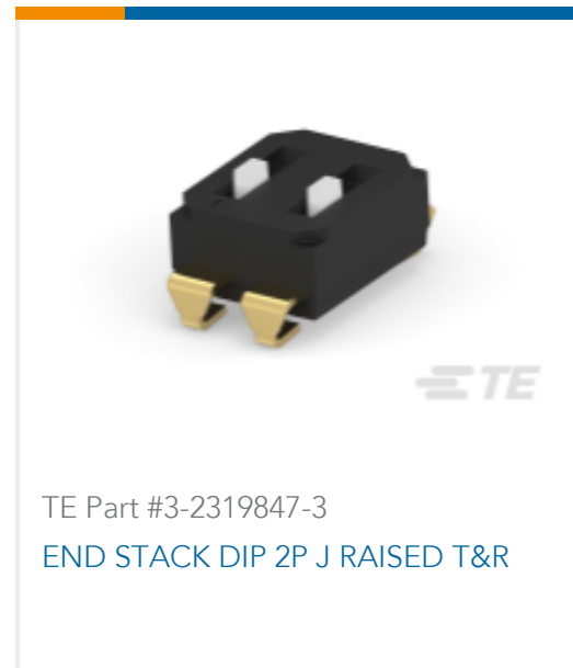
TE Part #3-2319847-3 END STACK DIP 2P J RAISED T&R