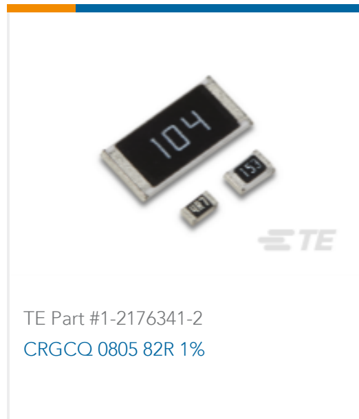
TE Part #1-2176341-2 CRGCQ 0805 82R 1%