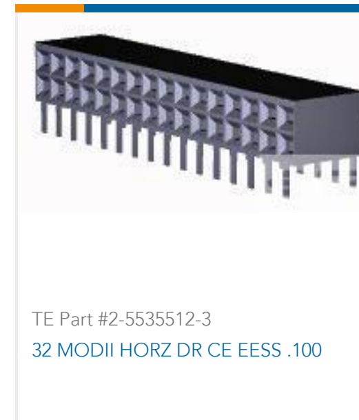
TE Part #2-5535512-3 32 MODII HORZ DR CE EESS .100