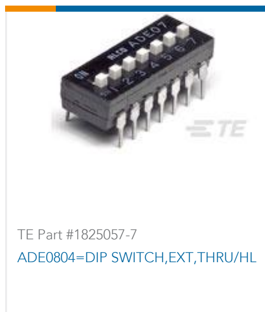
TE Part #1825057-7 ADE0804=DIP SWITCH,EXT,THRU/HL