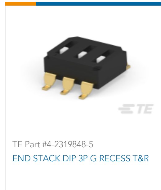
TE Part #4-2319848-5 END STACK DIP 3P G RECESS T&R