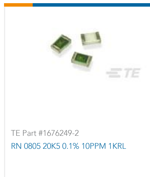
TE Part #1676249-2 RN 0805 20K5 0.1% 10PPM 1KRL