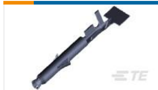
TE Part #170361-3 MINI UNIVERSAL M-N-L SOCKET