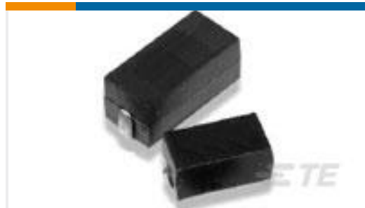
TE Part #1879011-9 SMF2 470R 5%