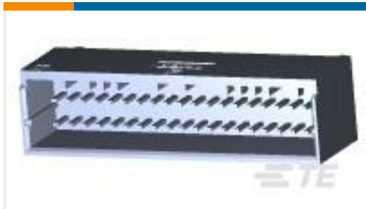
TE Part #1-1827872-0 DYNAMIC 1100D HDR ASSY V 40PX BLACK GOLD