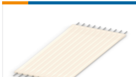
TE Part #2-1474654-5 FSN-23A-5