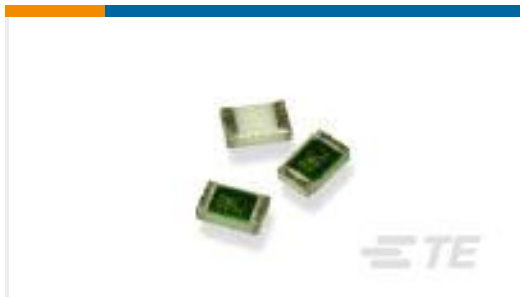
TE Part #9-1676481-9 CPF 0603 120K 0.1% 25PPM 1K RL