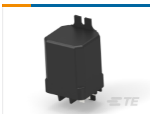
TE Part # 1393117-2 KUMP-7D58-36=KU