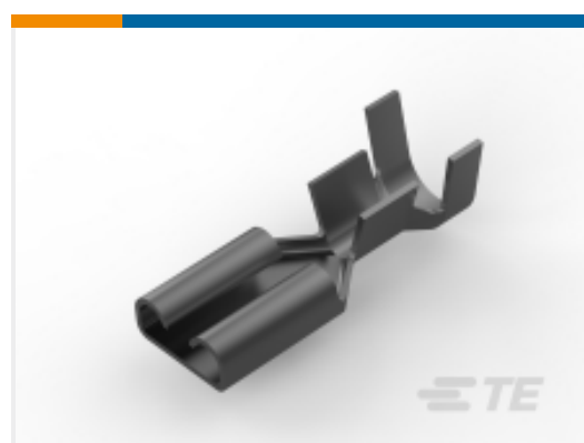
TE Part # 281197-2 FF 187 REC 1.0-2.5MM2 PTBR