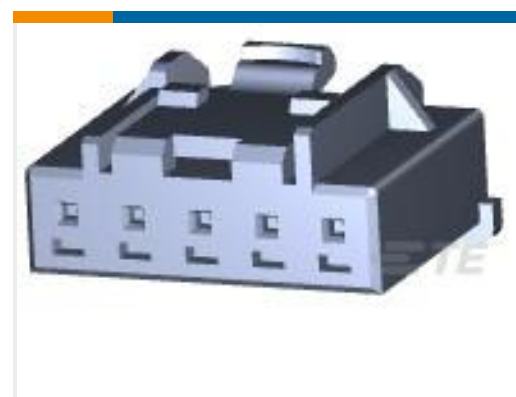
TE Part #5-1971793-4 NEW GI CONN2.5 PLUG HSG 5P YLW