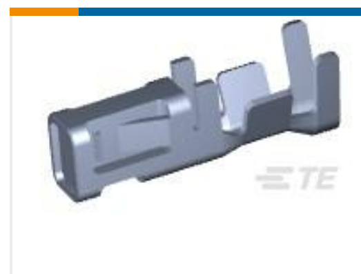
TE Part #1971795-1 NEW GI CONN2.5 REC. CONTACT