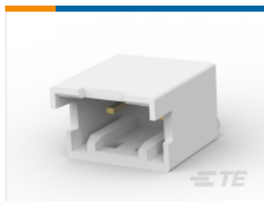
TE Part #6-1971798-1 Glow Wire Sig GRACE INERTIA Header