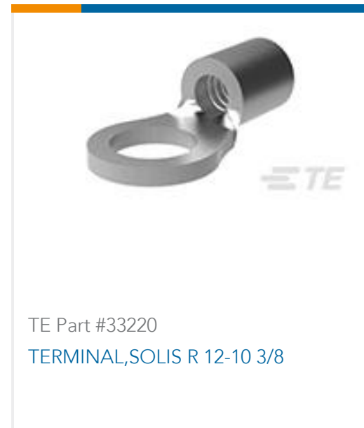
TE Part #33220 TERMINAL,SOLIS R 12-10 3/8