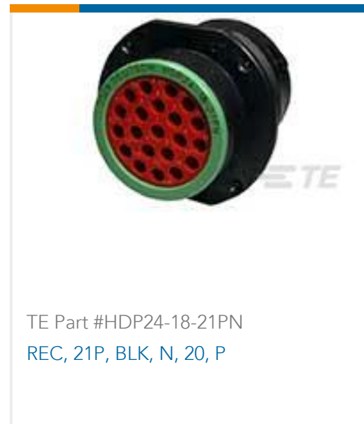
TE Part #HDP24-18-21PN REC, 21P, BLK, N, 20, P