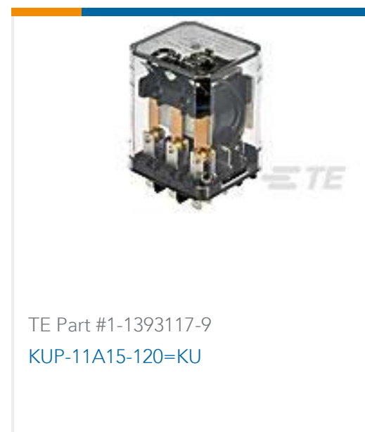
TE Part #1-1393117-9 KUP-11A15-120=KU