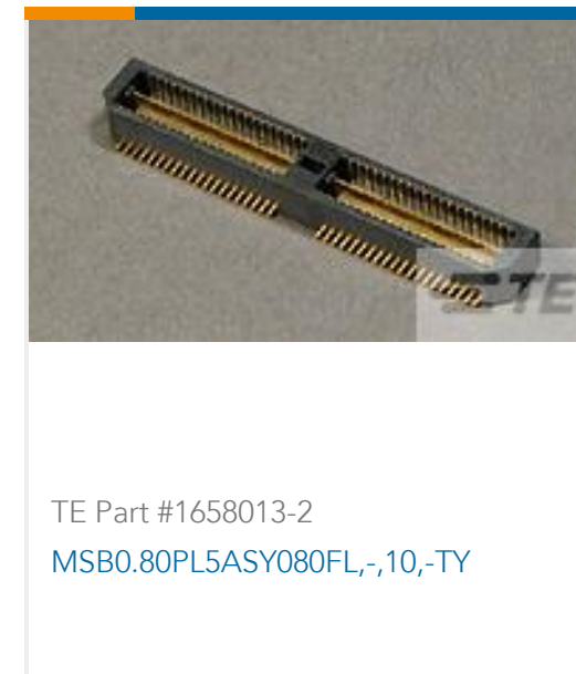
TE Part #1658013-2 MSB0.80PL5ASY080FL,-,10,-TY