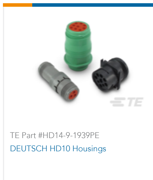
TE Part #HD14-9-1939PE DEUTSCH HD10 Housings