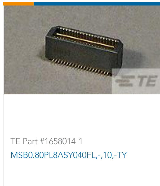
TE Part #1658014-1 MSB0.80PL8ASY040FL,-,10,-TY