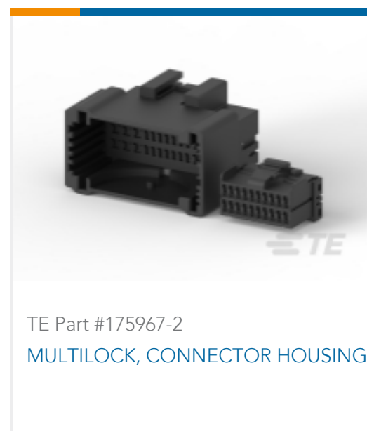
TE Part #175967-2 MULTILOCK, CONNECTOR HOUSING