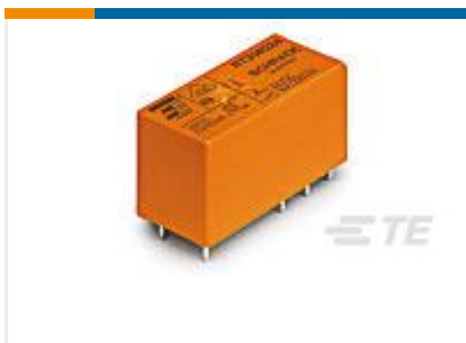
TE Part #9-1393239-3 RT314006