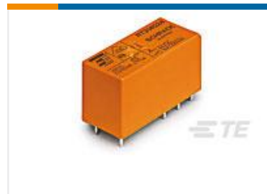
TE Part #6-1393243-8 RT424024