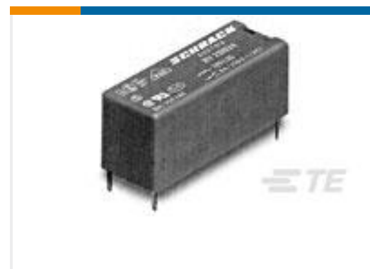
TE Part #4-1393224-6 RY211012