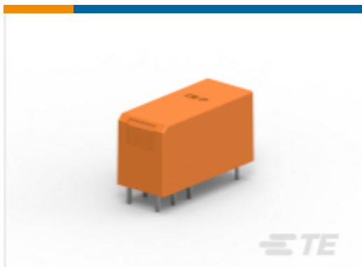
TE Part #2-1415899-2 PCB Power Relay: 12-16 Amp, Monostable