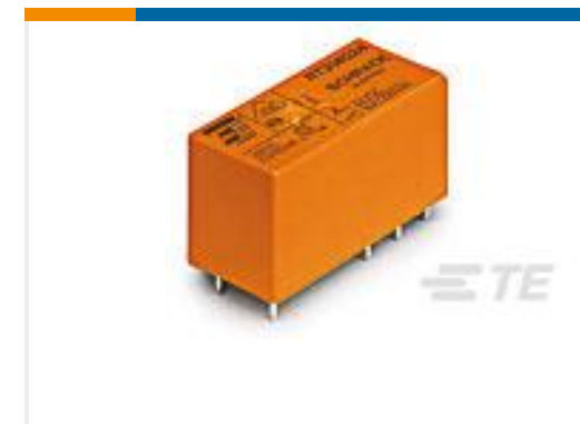
TE Part #7-1393239-5 RT31L024