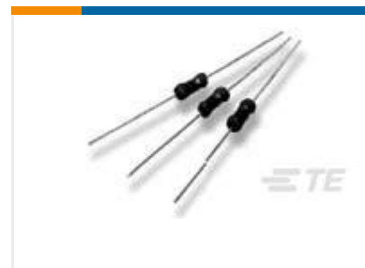
TE Part #2-1879353-2 RR02 5% 33K AMMO