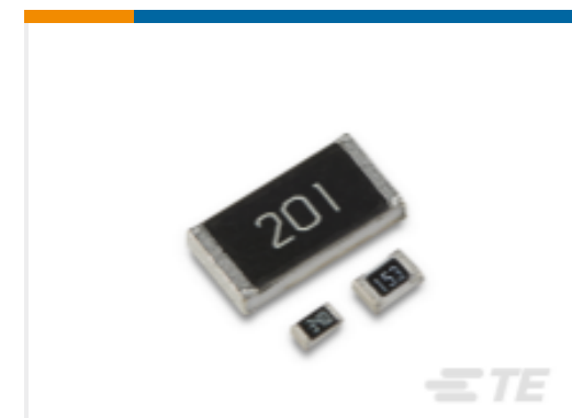
TE Part #2176326-3 CRGP 0603 15R 1%