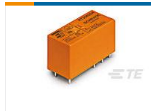
TE Part #6-1393243-3 RT424012