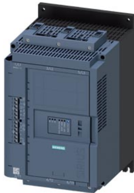
SIRIUS soft starter 200-480 V 47 A, 24 V AC/DC Screw terminals Thermistor input