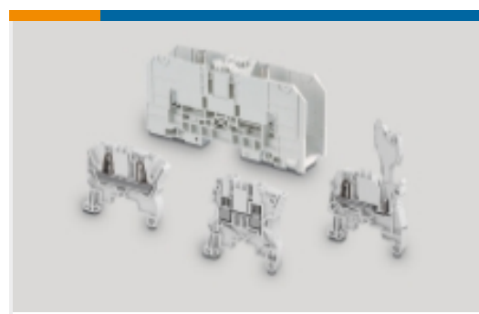
Modular Terminal Blocks(320)