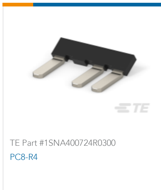
TE Part #1SNA400724R0300 PC8-R4