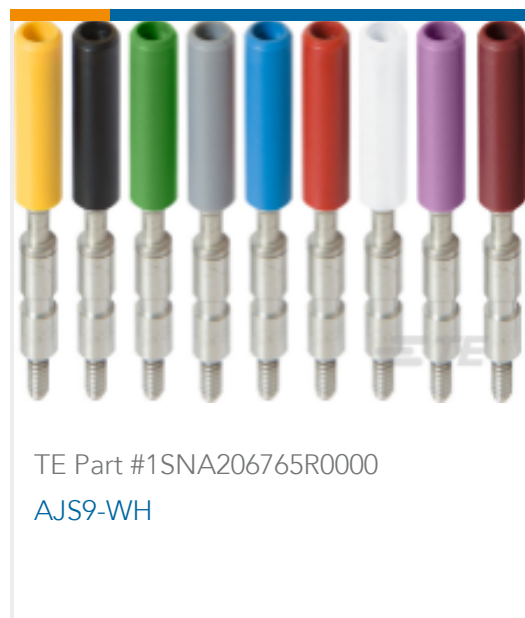
TE Part #1SNA206765R0000 AJS9-WH