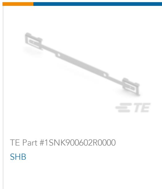
TE Part #1SNK900602R0000 SHB