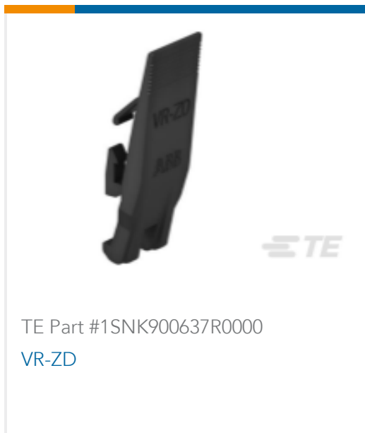
TE Part #1SNK900637R0000 VR-ZD