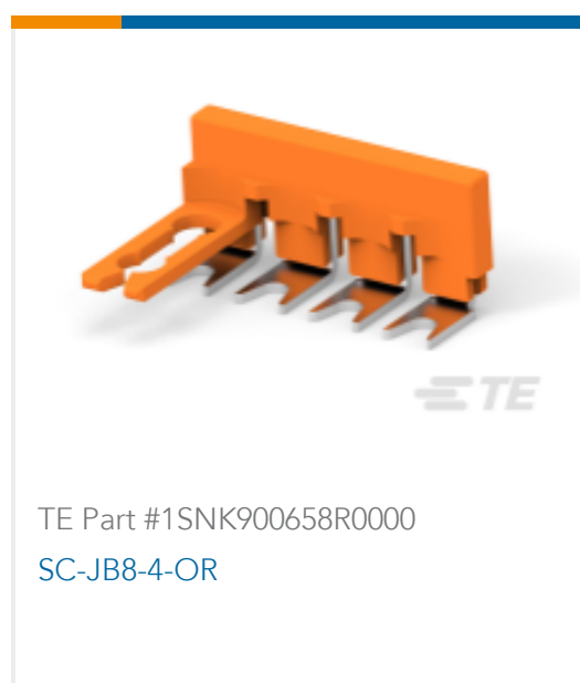
TE Part #1SNK900658R0000 SC-JB8-4-OR