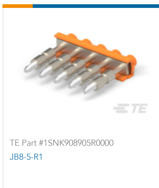
TE Part #1SNK908905R0000 JB8-5-R1