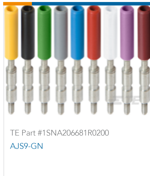
TE Part #1SNA206681R0200 AJS9-GN