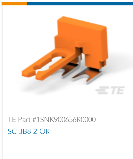
TE Part #1SNK900656R0000 SC-JB8-2-OR