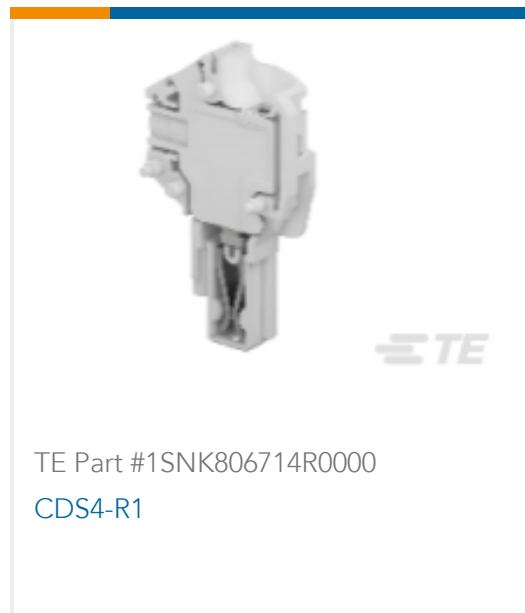
TE Part #1SNK806714R0000 CDS4-R1