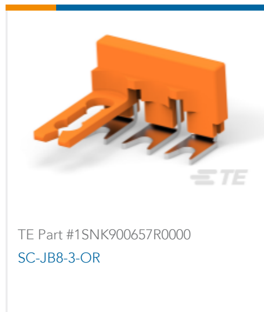
TE Part #1SNK900657R0000 SC-JB8-3-OR