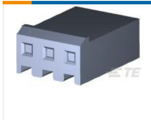
TE Part #640250-3 03P SL156 HSG W/LCK RAMP NATL