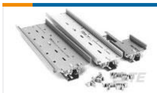
TE Part #1-1437685-3 2TK2-48=SNAP TRACK PVC CHANNEL