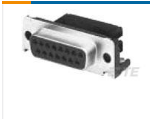
TE Part #5747836-4 09 MSFL RCPT RA 590 (IN,FM,BL)