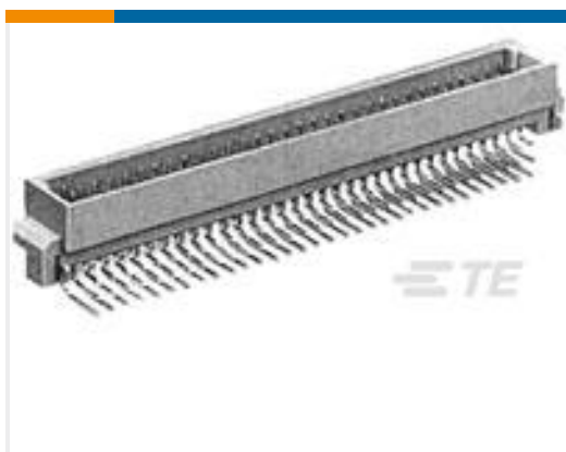
TE Part #5650473-5 ASSY,PIN,EUROCARD,TYPE C,LEAD-