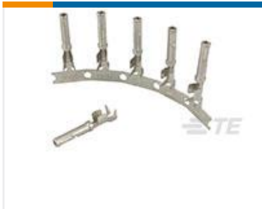
TE Part #1062-16-1422 SOC, SF, SIZE 16, 14-18, SLVLES, NI/NI