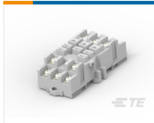
TE Part #2-1419106-5 27E893=SOCKET,KU,11,QC,POLY,NA-