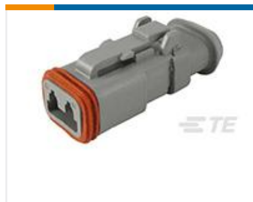
TE Part #DT06-2S-CE04 PLG, 2P, GRY, E, XCAP