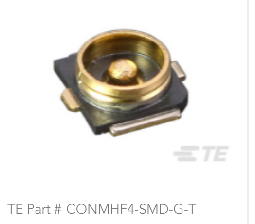
TE Part # CONMHF4-SMD-G-T MHF4 Jack 50 Ohm PCB Surface Mount