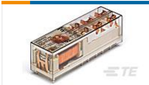
TE Part #6-1415537-5 SR6A6K24