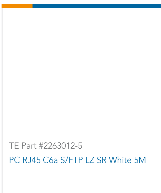
TE Part #2263012-5 PC RJ45 C6a S/FTP LZ SR White 5M