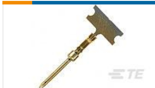
TE Part #5-166053-1 COSI PIN CONTACT HD20 DF; 24-20 AWG