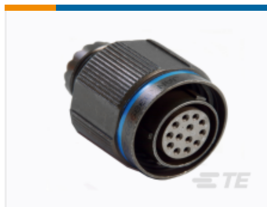
TE Part #YDTS26W19-11SAC001 PLUG ASSY