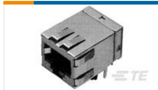
TE Part #1-5406299-1 MJ ASSY,S/P,8POS,SH,RVPGT,CAT5