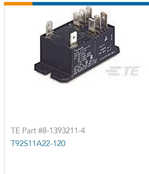
TE Part #8-1393211-4 T92S11A22-120