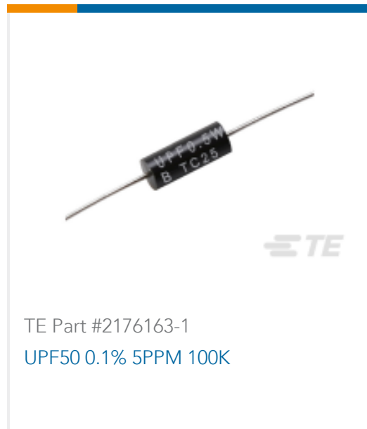
TE Part #2176163-1 UPF50 0.1% 5PPM 100K