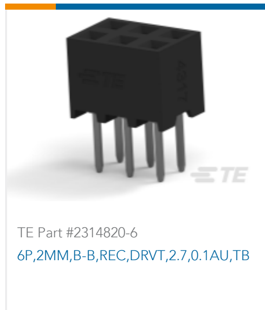
TE Part #2314820-6 6P,2MM,B-B,REC,DRVT,2.7,0.1AU,TB