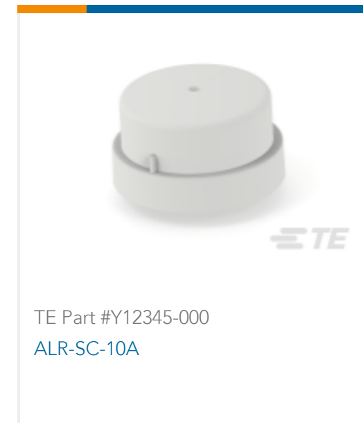
TE Part #Y12345-000 ALR-SC-10A