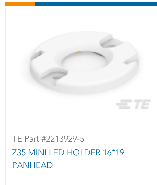
TE Part #2213929-5 Z35 MINI LED HOLDER 16*19 PANHEAD