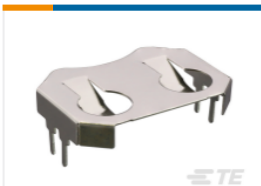
TE Part #BAT-HLD-001-THM Battery Holder 2032 2025 THM Bulk Pack