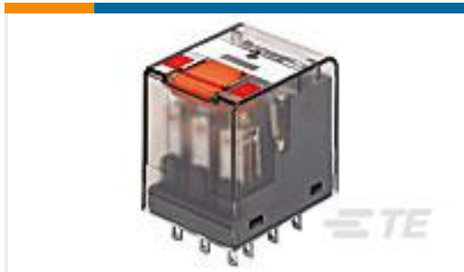
TE Part #1-1393154-2 PT570024