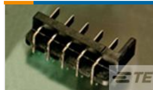
TE Part #5787428-1 HDR ASY,RA,LKEY,STR TAIL,12.0V