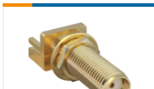
TE Part #L9000264-01 SMA Jack 50 Ohm .031 PCB Edge Mount