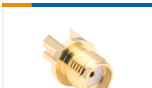
TE Part #L9000262-01 SMA Jack 50 Ohm .031 PCB Edge Mount