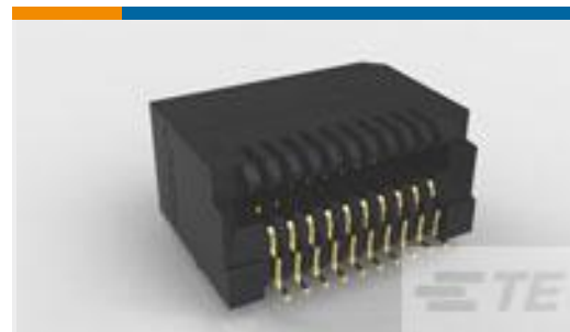
TE Part #1888247-1 20 POS SMT CONN, SFP/SFP+, 30A DUAL SMT