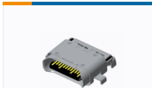
TE Part #1-2295018-2 USB TYPE C, REC OFFSET 0.65MM DUAL SMT