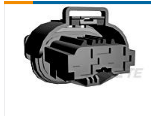
TE Part #1544317-1 PC 2V 8MM WP NG1 N