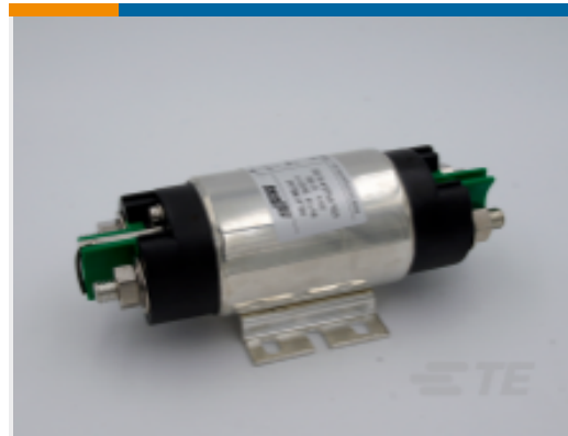
TE Part #K1021599 Relay 29-221-12