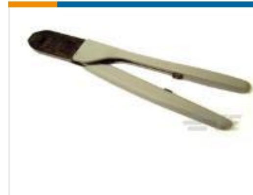
TE Part #91533-1 CCII LOCKING CLIP 26-22 ASSY