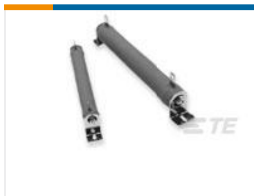
TE Part #1879451-7 TE 600W 3R3 5% Bracket