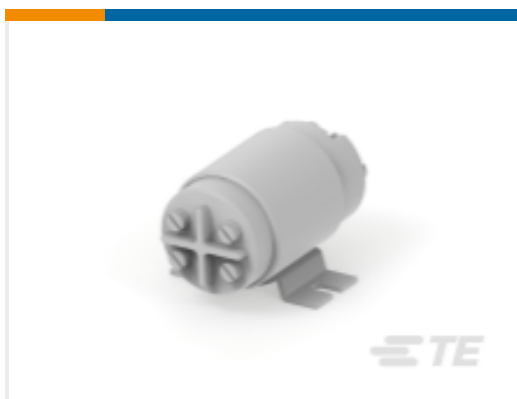
TE Part #K1121830 Relay 29-011-02A