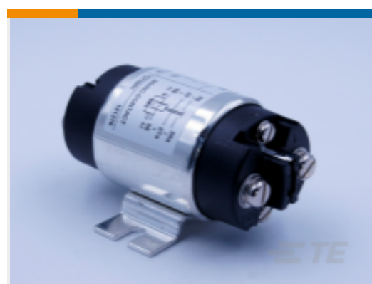
TE Part # CAT-AL6-KSPR2975 Power Relay, 75A, Standard, Monostable, DC