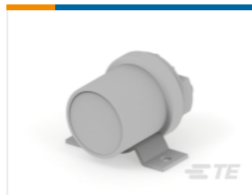
TE Part #K1012918 Relay 26-70-04