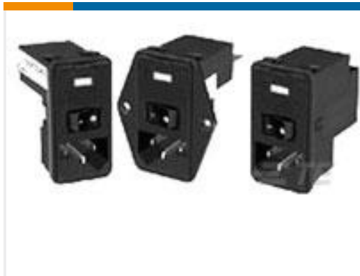
TE Part #2-6609106-6 PS0SXDH60=C1149