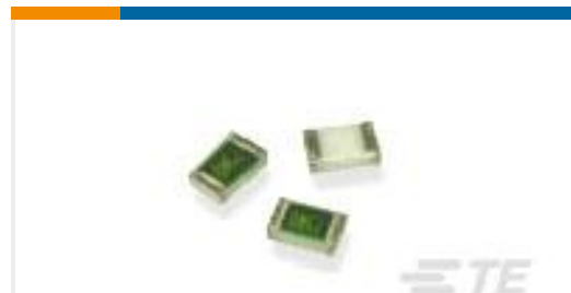
TE Part #2176087-5 RP 1J 0.166W 75R 0.1% 25PPM 1K RL