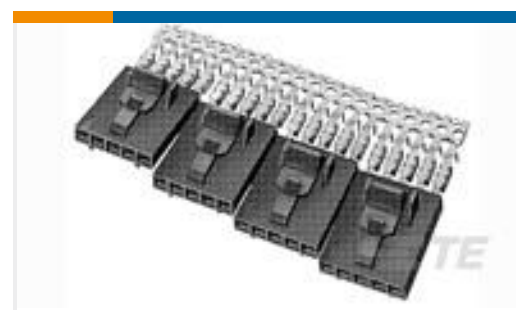
TE Part #5-103961-4 4X5 MTE RCPT SR LATCH .100CL