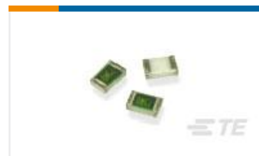
TE Part #7-2176092-0 RP 2A 0.25W 4K02 0.1% 25PPM 1K RL