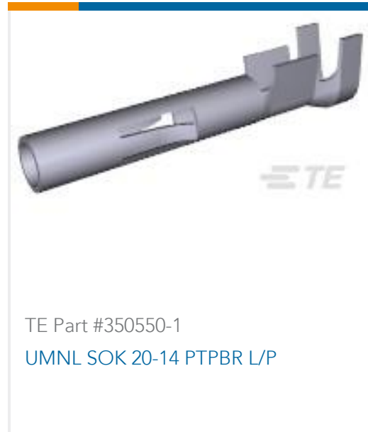
TE Part #350550-1 UMNL SOK 20-14 PTPBR L/P