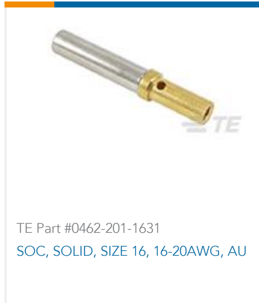
TE Part #0462-201-1631 SOC, SOLID, SIZE 16, 16-20AWG, AU