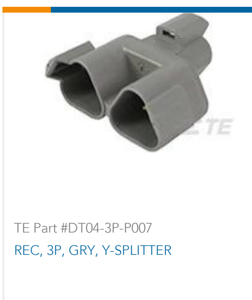
TE Part #DT04-3P-P007 REC, 3P, GRY, Y-SPLITTER