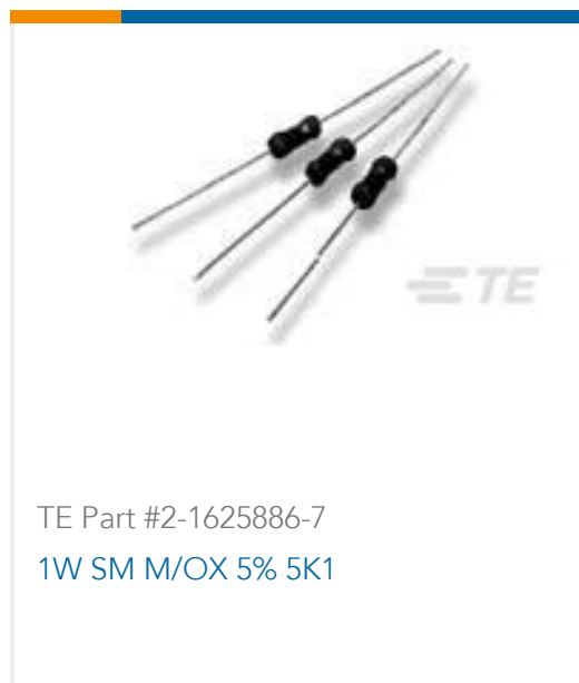
TE Part #2-1625886-7 1W SM M/OX 5% 5K1