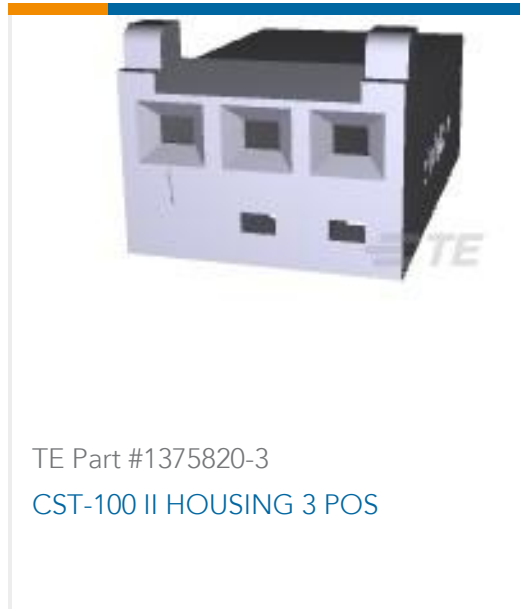
TE Part #1375820-3 CST-100 II HOUSING 3 POS