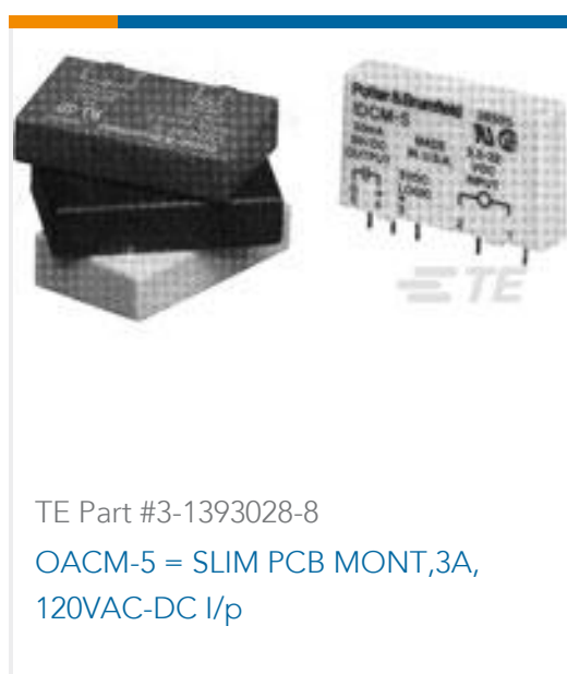
TE Part #3-1393028-8 OACM-5 = SLIM PCB MONT, 3A, 120VAC-DC I/p