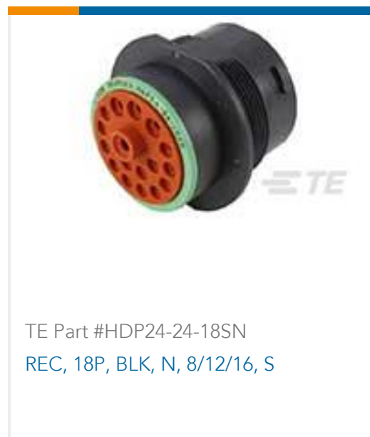
TE Part #HDP24-24-18SN REC, 18P, BLK, N, 8/12/16, S