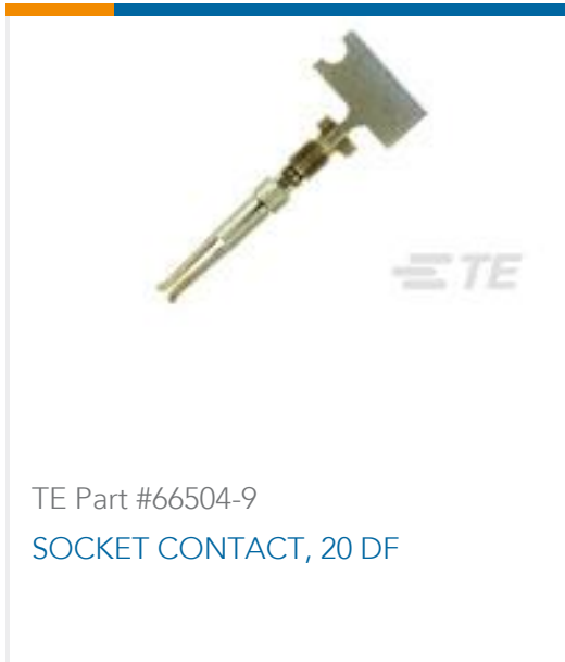
TE Part #66504-9 SOCKET CONTACT, 20 DF