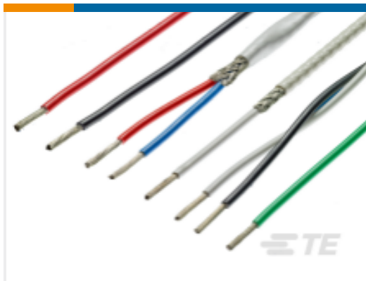
TE Part #3643333001 100G0121-0.60-9/9