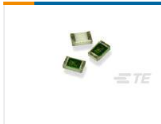
TE Part #1-1879336-4 CPF 0603 316R 1% 50PPM 1K RL