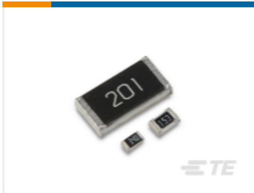
TE Part #2-2176330-7 CRGP 2010 1K5 1%