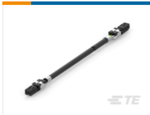
TE Part #2362764-3 MATENET,CABLE ASSY,1 GBPS UTP