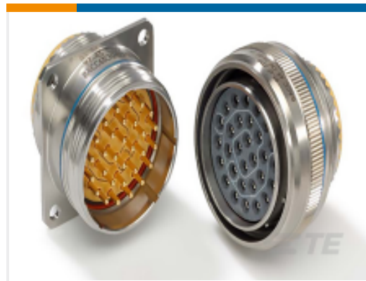
TE Part #ZPF0000000000036945 983-6SE 14-04 SN-L