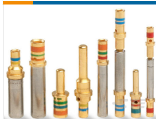
TE Part #ZPF000000000001233 097-0165-12