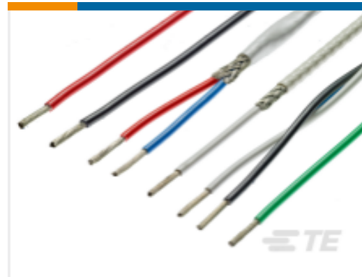
TE Part #7672673001 100G0121-0.40-9/9