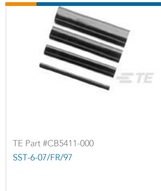
TE Part #CB5411-000 SST-6-07/FR/97