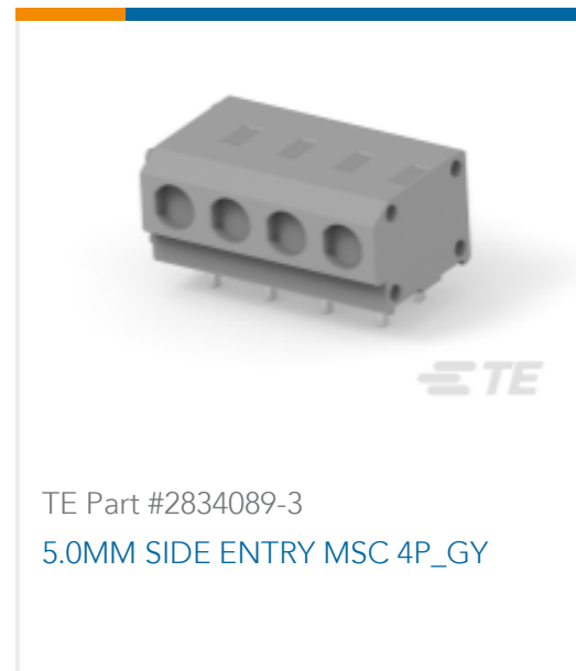
TE Part #2834089-3 5.0MM SIDE ENTRY MSC 4P_GY