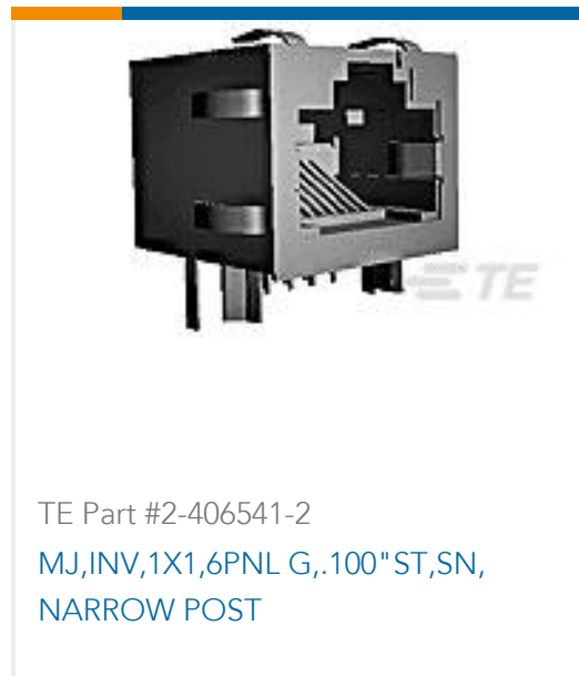
TE Part #2-406541-2 MJ,INV,1X1,6PNL G.,100"ST,SN, NARROW POST