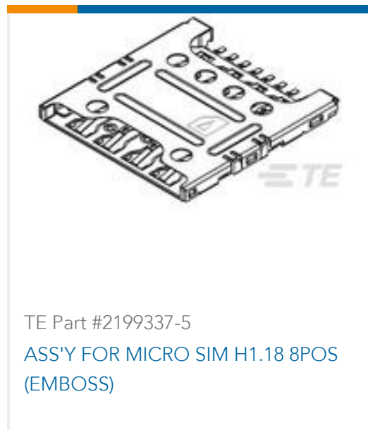
TE Part #2199337-5 ASS'Y FOR MICRO SIM H1.18 8POS (EMBOSS)