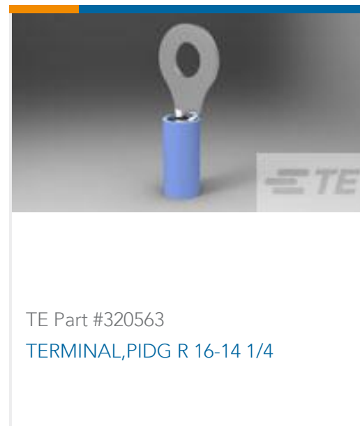
TE Part #320563 TERMINAL,PIDG R 16-14 1/4