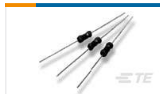
TE Part #4-1879355-2 RR03 5% 220K AMMO