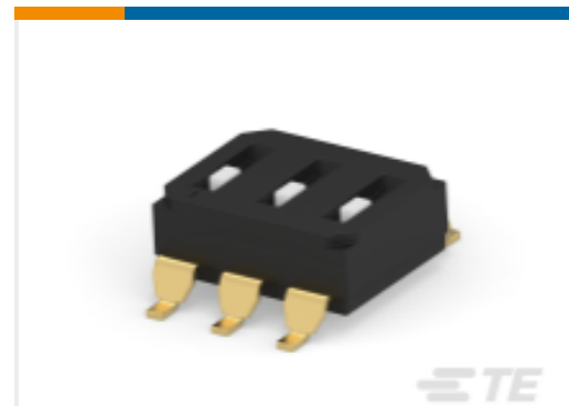
TE Part #4-2319848-5 END STACK DIP 3P G RECESS T&R