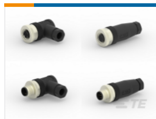
TE Part #T4110402041-000 M12 Field Installable Unshielded