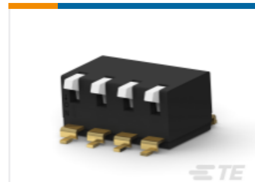
TE Part #2319764-2 E STACK PIANO 4P G LONG TUBE PD ON