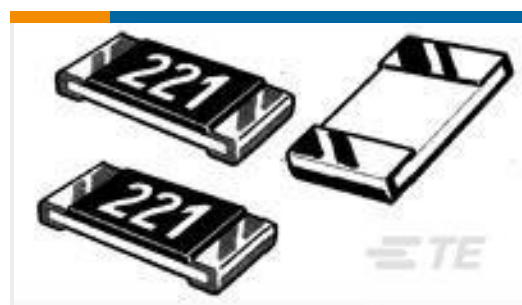
TE Part #1-2176070-3 3521 33R 1% 2W