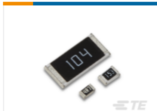
TE Part #1-2176337-2 CRGCQ 0402 82R 1%