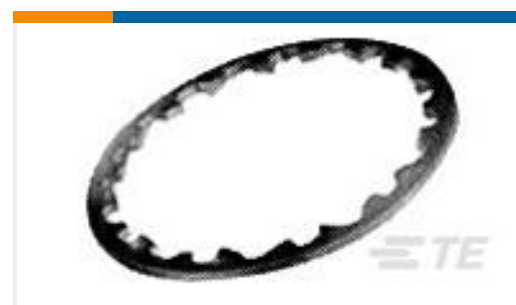
TE Part #1-329632-2 LOCKWASHER, PLATED