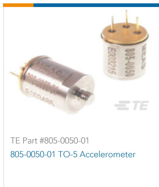
TE Part #805-0050-01 805-0050-01 TO-5 Accelerometer