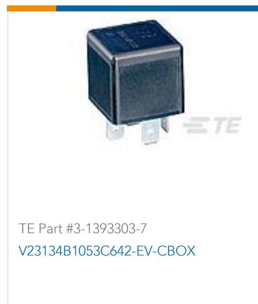
TE Part #3-1393303-7 V23134B1053C642-EV-CBOX