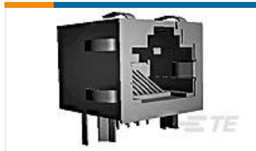
TE Part #1-406541-5 MJ,INV,1X1,0PNL G.,.100"ST,SN