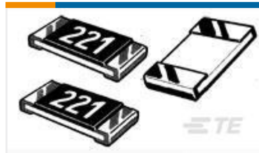
TE Part #4-2176230-2 3522 2K2 5% 3W