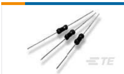
TE Part #3-1625892-7 3W SM M/OX 5% 2K2