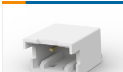
TE Part #6-1971798-3 Glow Wire Sig GRACE INERTIA Header