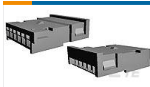
TE Part #936289-5 6POS MOS REC COD E