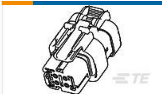
TE Part #776524-4 AS 16, 4P PLUG ASSY, RD, KEY 4