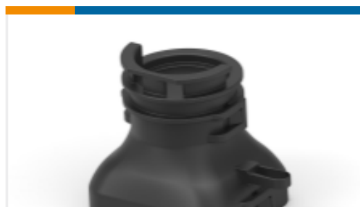
TE Part #2357302-2 BACKSHELL,CONN KIT