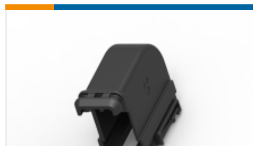
TE Part #1379918-1 COVER FOR 20W TAB HSG