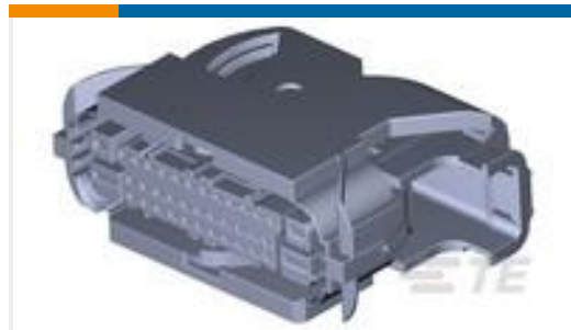
TE Part #1-2112502-1 38POS, MIXED,REC HSG,ASSY, SEALED