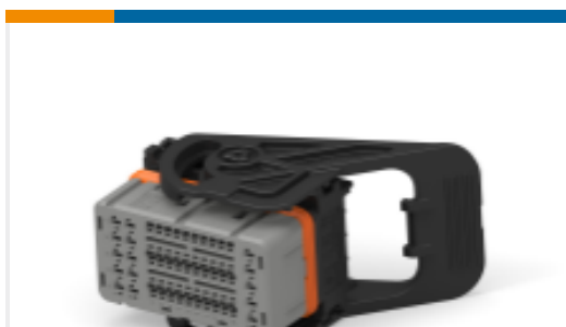
TE Part #2299987-4 65W PLUG ASSEMBLY