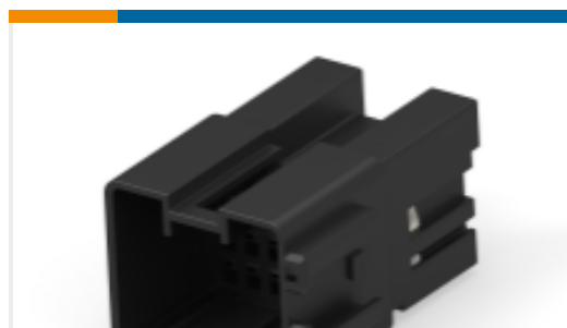
TE Part #2298672-1 20POS,HYBRID,TAB HSG ASSY, UNSLD,COD A