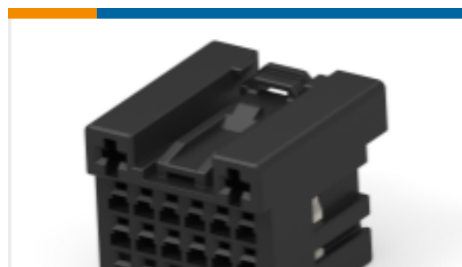
TE Part #2298671-1 20POS,HYBRID,REC HSG ASSY, UNSLD,COD A