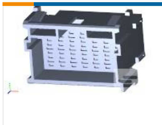
TE Part #1-967630-1 FLA STEGEHZ