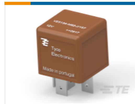
TE Part #5-1393304-8 V23134M0052X157-EV-CBOX