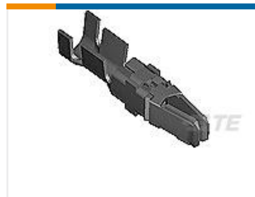
TE Part #1-66741-2 TYPE XII FEMALE CONTACT