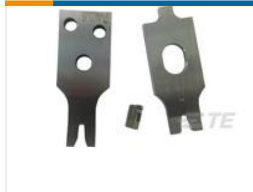
TE Part #7-2151426-7 OCEAN_2.0_SPARE_PART_KIT- 140F2100