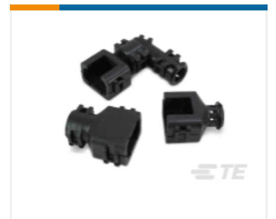
TE Part # CAT-AM7801-B128 AMPSEAL 16 Connectors Backshell