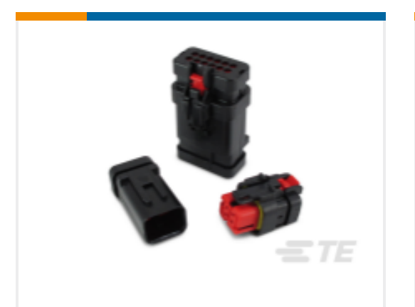
TE Part # CAT-AM7801-CH8172 AMPSEAL 16 Housings