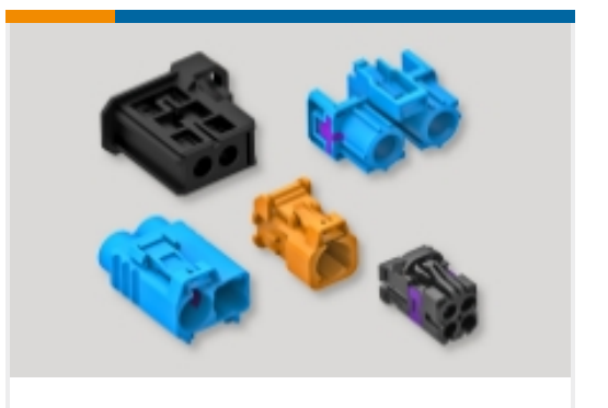
Data Connectivity Housings(3)