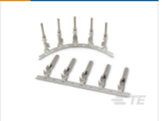
TE Part # CAT-AM7801-T273 Contacts: Size 16, 13A