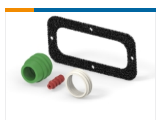
Connector Seals & Cavity Plugs(4)