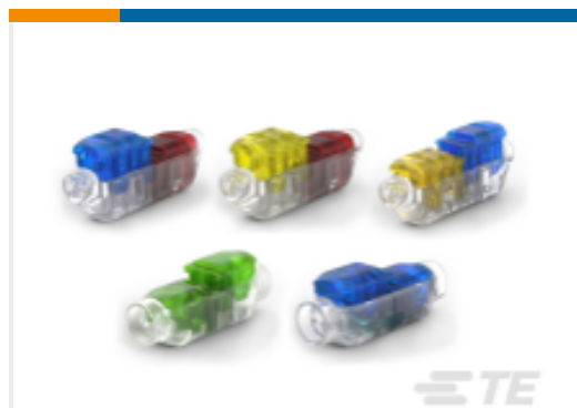
TE Part #2213600-1 CoolSplice Quick Connect Splice