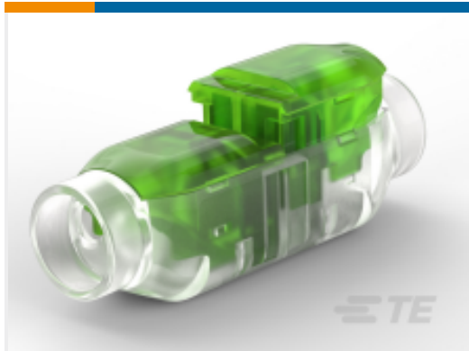
TE Part # 2213800-3 COOLSPICE NEW STANDARD