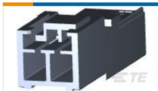
TE Part #176282-1 AMP UNIVERSAL POWER CAP 2P