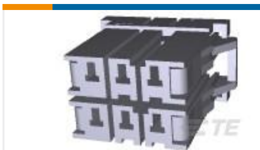
TE Part #2-178129-6 6-P DYNAMIC PLUG-H D3200 5.08