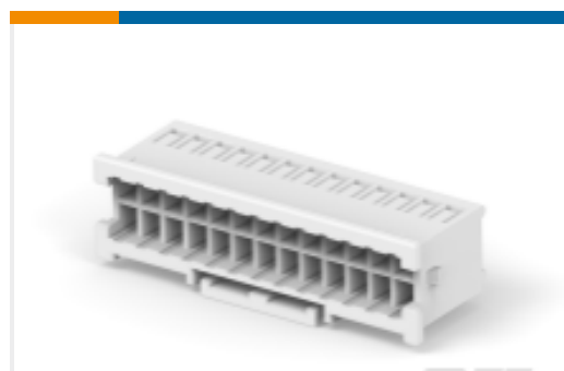
TE Part #2-2323743-6 HOUSING, PLUG, GWT, 26P, DUAL ROW, EP2.5