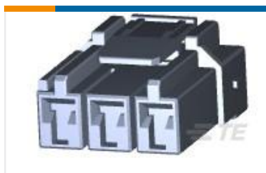
TE Part #1747995-1 GHC EYELET 6.2 3POS PLUG HOUSING NATURAL