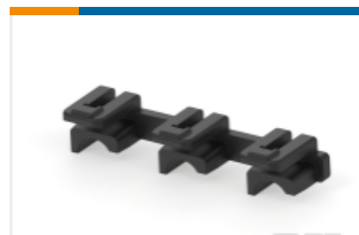
TE Part #2232563-1 GHC 9.0MM 3POS TPA