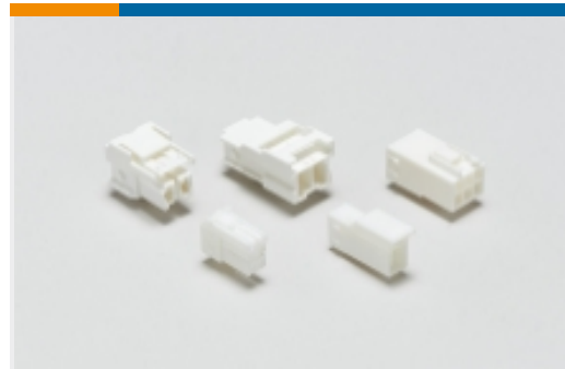
Rectangular Power Connectors(13)