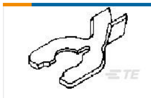
TE Part #63610-2 SPRING SPADE TERMINAL 14-10 AWG TPBR