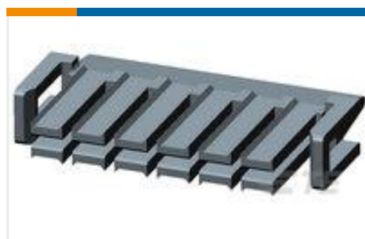
TE Part #2-1969541-6 RETAINER, TPA, DUAL ROW, EP2.5