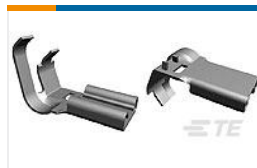
TE Part #2232111-3 250 FASTON, FLAG, REC., 12-20 AWG, TPBR