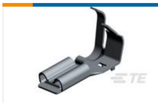
TE Part #2232342-1 187 PL EX FLAG REC. 22-16AWG PTBR