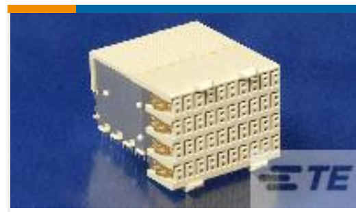
TE Part #2065657-1 zd Plus, 4 pair, receptacle assy