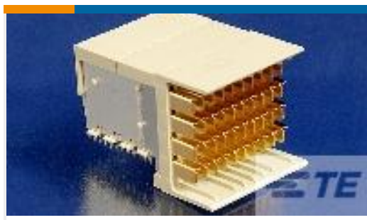
TE Part #6469048-1 HMZD 4PR RA HDR 80P ASSY LF