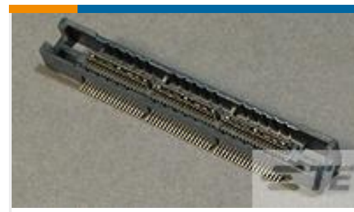
TE Part #1-5767096-0 MICT, REC, 114, ASY, .025, TAPE, CAP