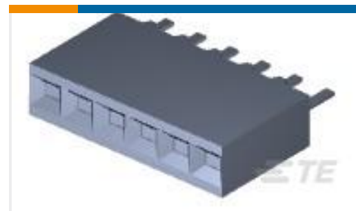
TE Part #5-534237-4 06 MODII VRT SR CE 100/115