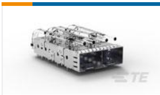
TE Part #2007262-1 SFP+ 1x2 Cage Assembly, Light