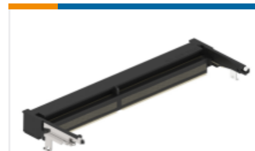
TE Part #2309411-5 DDR4 SODIMM 260P 8.0H STD