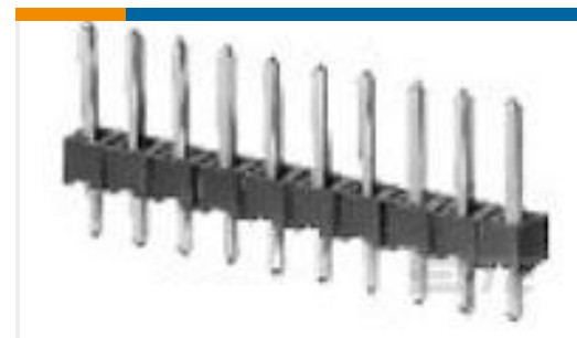
TE Part #5-146281-3 03 MODII HDR SRST B/A LF