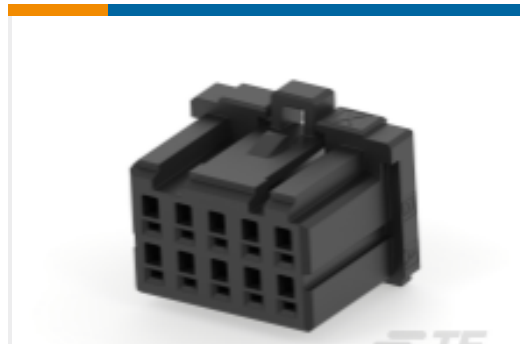
TE Part #1-1871465-2 Receptacle and Tab Housing: 2.5 mm Pitch, 250V