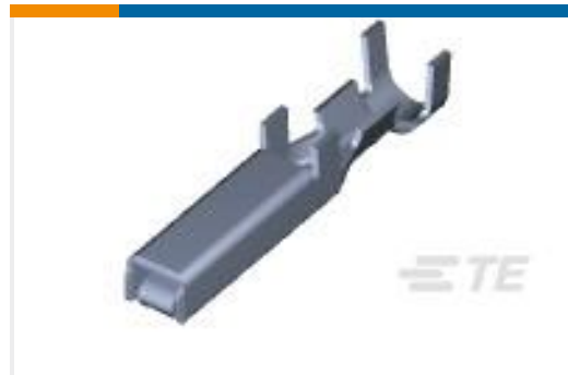
TE Part #1-175217-2 DYNAMIC D-3 REC CONT. M AU 0.38 L/P