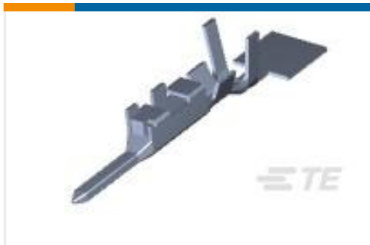
TE Part #1903117-2 DYNAMIC D1000 TAB CONT AU 0.38 um L L/P