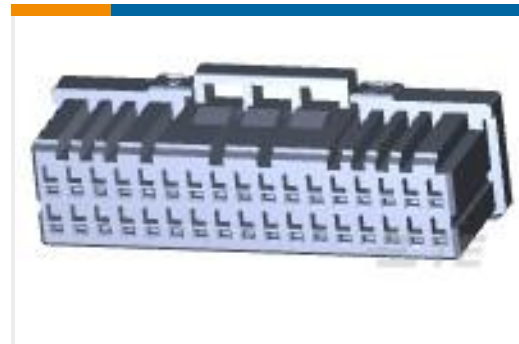
TE Part #1-1827863-7 DYNAMIC 1100D REC HSG X 34P BLACK