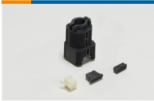
Rectangular Connector Housings(2)