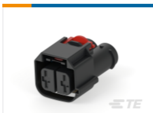
TE Part #2343344-1 2POS,MCON 12,REC HSG,SLD,COD A