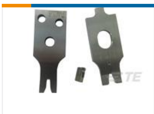
TE Part #7-2151145-7 OCEAN_2.0_SPARE_PART_KIT-155F180OV