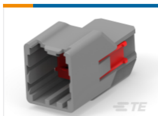
TE Part #1411169-4 GET;2X4POS. MALE CONNECTOR ASSY