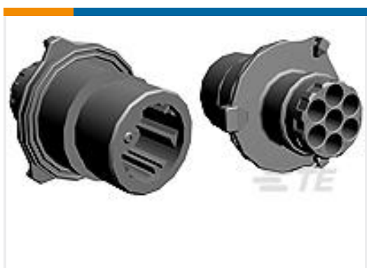
TE Part #2-1718230-1 1,5MM PIN HSG 5-7 POS ASSY