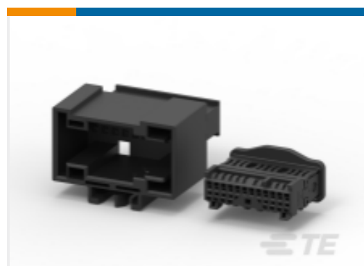
TE Part #1-968699-1 MQS, CONNECTOR HOUSING