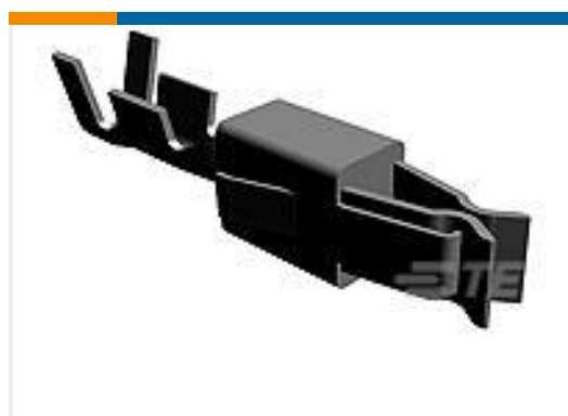
TE Part #965999-1 JPT A REC 2.8 Contact SRC Sn