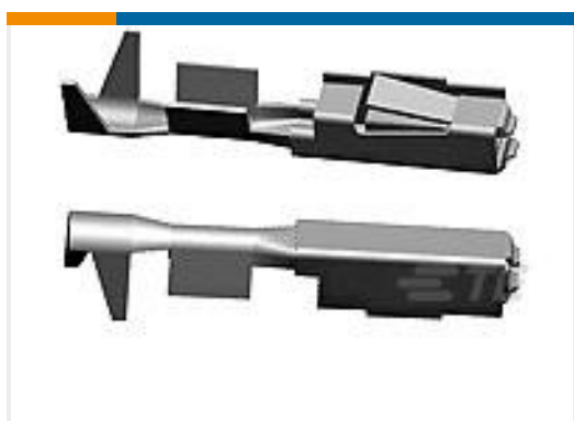
TE Part #5-963715-1 MQS0,63 Sn rec LL unseal. 0,5-0,75