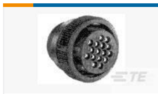
TE Part #213849-1 CPC PLUG ASSEMBLY SIZE 17-16