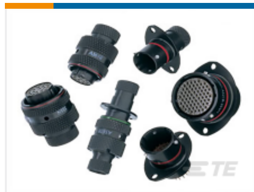
TE Part #AS214-35PA RECEPT.BOX MNTG. TYPE 2