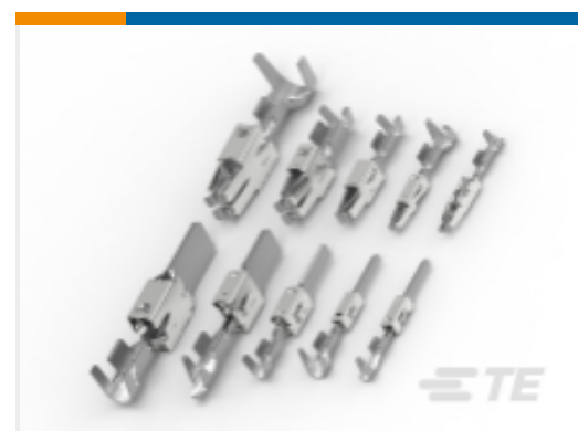
TE Part #969005-3 TIMER, RECEPTACLE AND TAB