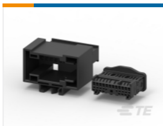
TE Part #1-1438608-3 MQS, CONNECTOR HOUSING