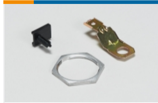
Other Automotive Connector Accessories(7)