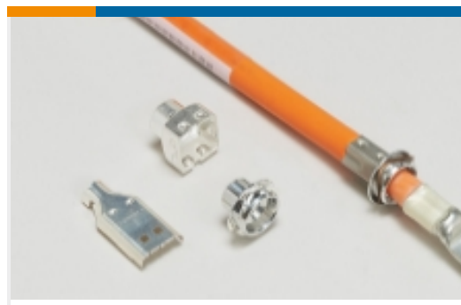
Automotive Connector EMC Shielding (3)