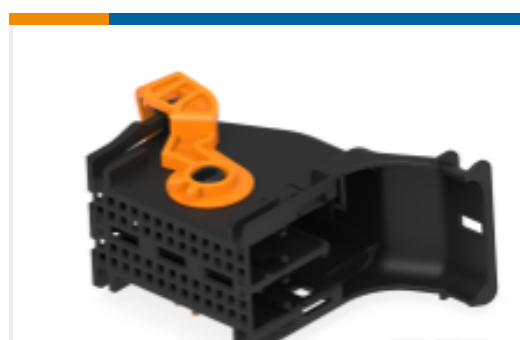
TE Part #2236060-1 COVER,ASSY