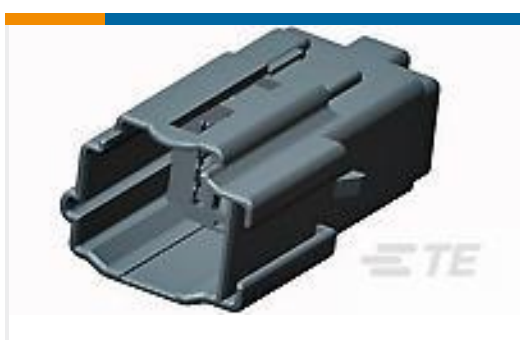
TE Part #2141994-1 10POS,TAB 0.63X0.64,PIN HSG,ASSY