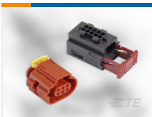
TE Part #1-968307-2 Timer Connector Housing