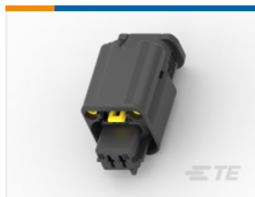
TE Part #2141502-1 2POS,1.5MM SFC,REC HSG,ASSY, SEALED,BK