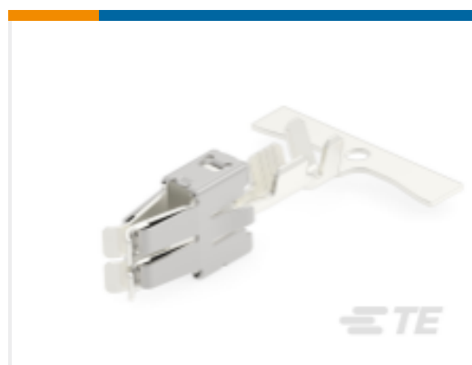
TE Part #1862028-5 SPT REC 6.3 Contact SRC Ag