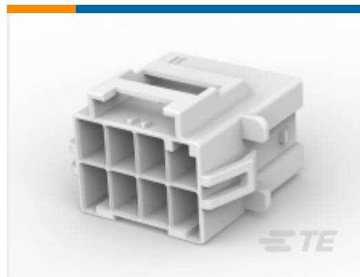
TE Part #1-1971772-4 Standard Temperature Caps | POWER TRIPLE LOCK