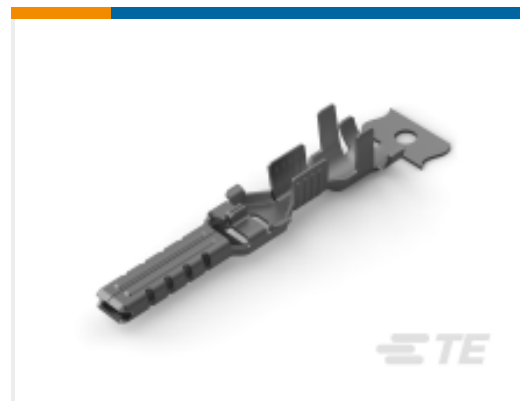
TE Part #1971784-1 Tab Contact — POWER TRIPLE LOCK