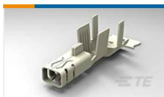
TE Part #1971787-2 PTL RECEPTACLE CONTACT, 2X18 AWG