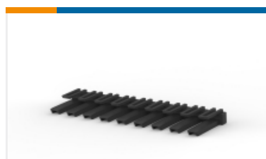
TE Part #1744544-9 EP II TPA 09P, BLACK