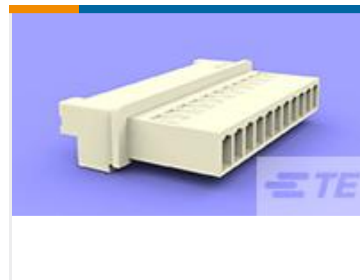
TE Part #1969588-2 HSG, REC, FREE-HANGING, SINGLE ROW, EP2.5