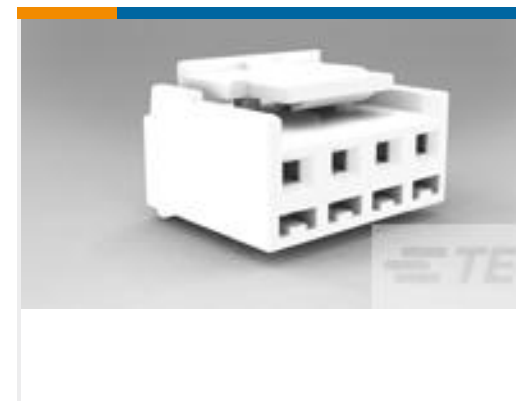
TE Part #2132781-9 09P EP-II HOUSING, NATURAL