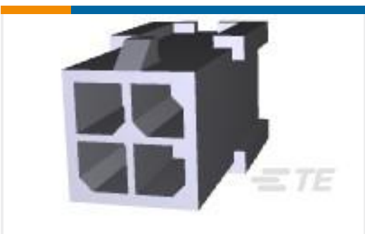
TE Part #794616-4 FREE HANG DBL ROW HSG 4 POS