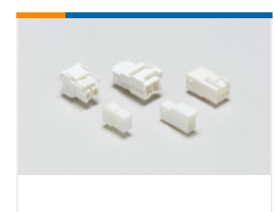
Rectangular Power Connectors (469)