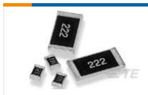
TE Part #1623403-1 CRG1206 1% 100R