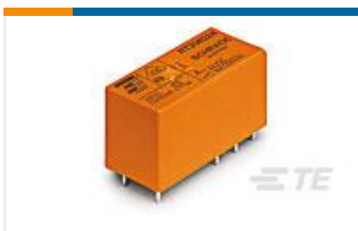
TE Part #3-1419108-8 RTD34024