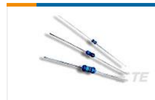
TE Part #1622297-1 LR1 1% 100R