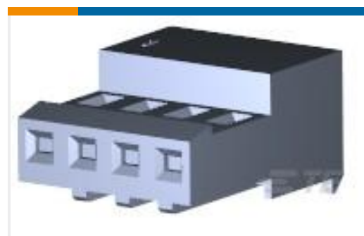
TE Part #3-640442-4 04P MTA100 CONN ASSY BLU