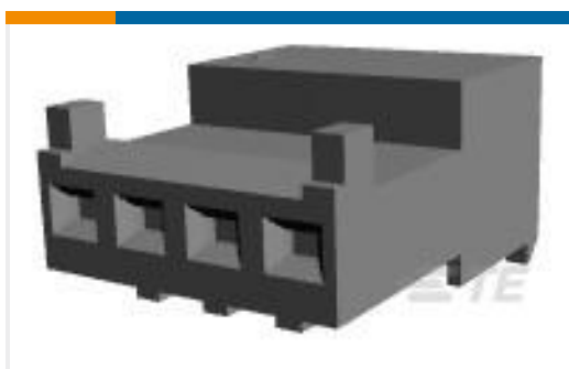
TE Part #3-643814-4 04P MTA100 CONN ASSY POL RIB