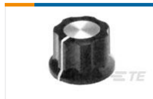
TE Part #5-1437624-0 PKES60B1/4=KNOB PLSTC FLUTED W