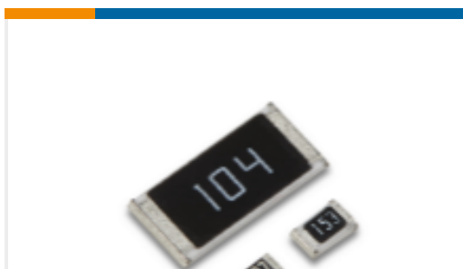
TE Part #3-2176337-1 CRGCO 0402 3K3 1%