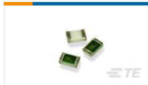
TE Part #1-1879417-0 CPF 0603 430K 0.1% 25PPM 1K RL