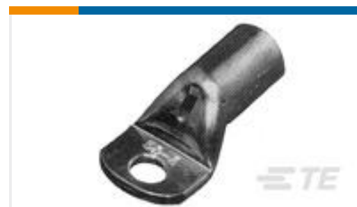
TE Part #710032-4 XCT 6-6