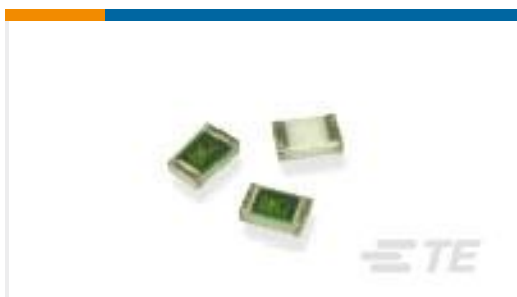
TE Part #2-2176092-3 RP 2A 0.25W 1K15 0.1% 25PPM 1K RL