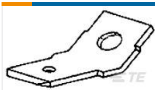
TE Part #61761-2 187 FASTON TAB TPBR