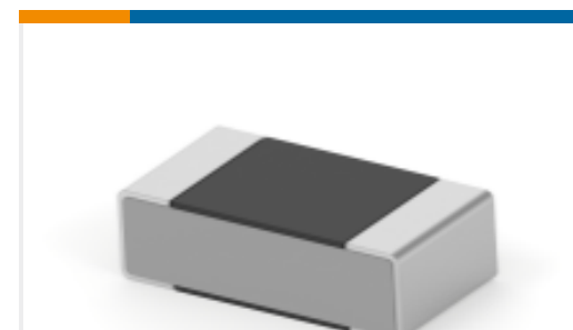
TE Part #4-1879207-8 RN 0603 475K 0.1% 10PPM 1K RL