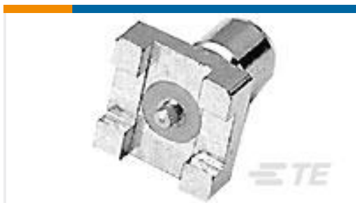
TE Part #1-1337604-0 SMB SMT Skt 50Ohm Gold Pltd