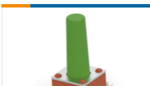
TE Part #2-1977223-8 FSM14JSMAS=6MM TACT SWITCH, SMT 160gf