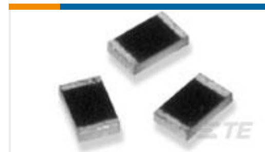
TE Part #2-1625868-0 RP 2A 0.25W 100K 0.1% 25PPM 1K RL