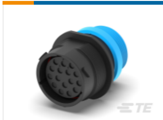
TE Part #HDP24-24-16SE-L015 REC, 16P, BLK, E, THD, 12, S