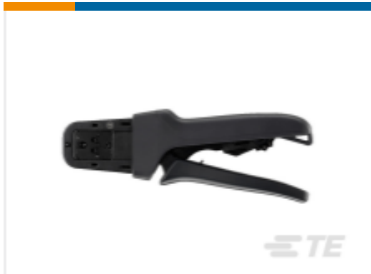
TE Part #DTT-20-03 CRIMP TOOL