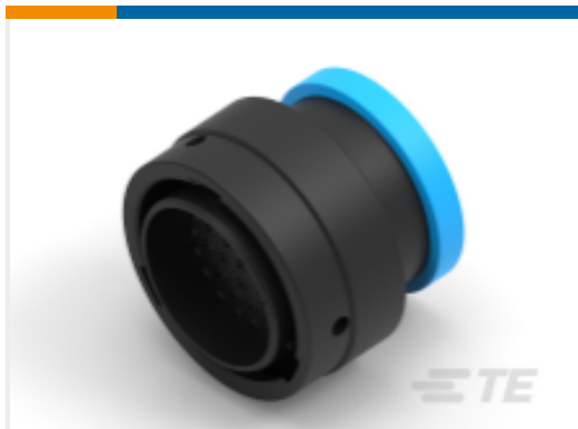
TE Part #YHDP26-24-35PEL017 PLG, 35P, BLK, E, RNG, 16/20, P