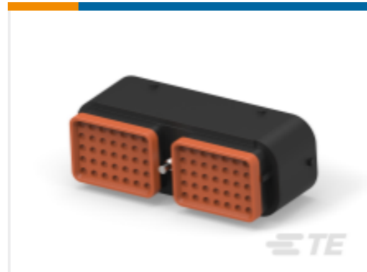
TE Part #DRC16-70SBE-P013UK PLG, 70P, BLK, E, SEAL BOND, B