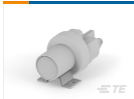
TE Part #K1008699 Relay 26-60-05