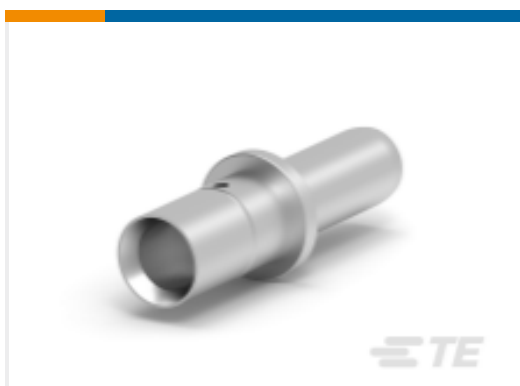
TE Part #SRK-PC-080-25-601 PIN, SOLID, SIZE M8, 25mm2, AG