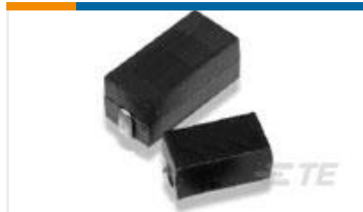
TE Part #8-1879234-0 SMF5 1M0 5%