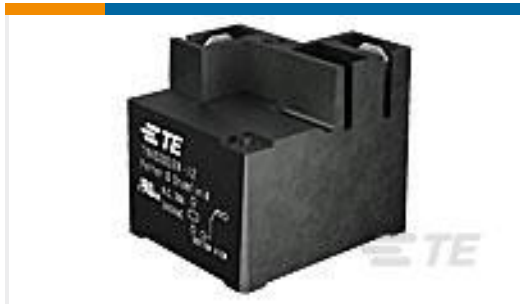
TE Part #6-1419102-0 T9AP1D52-12