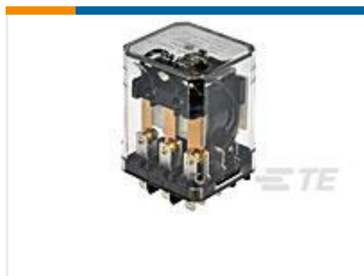
TE Part #9-1393116-0 KUMP-14D18-12=KU