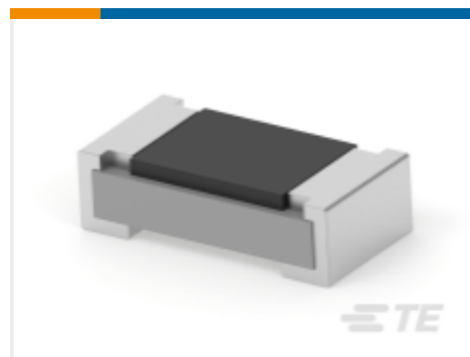
TE Part #5-2176237-0 CPF A 0603 30K 0.1% 25PPM 5K RL