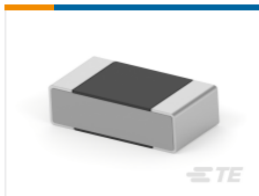
TE Part #7-1879140-7 RN 0603 115K 0.1% 10PPM 5K RL