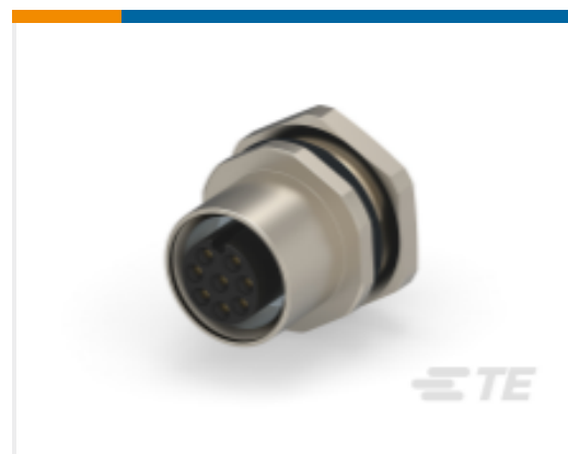
TE Part #T4171320008-001 M12,FRONT MOUNT,FEMALE, A, 8P, 0.2M WIRE