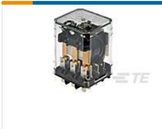
TE Part #7-1393117-8 KUP-14A15-120=KU-