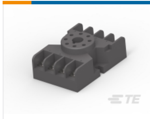
TE Part #1393143-6 27E122=SOCKET,KRP,8,SCW,PLES