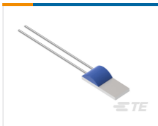
TE Part #NB-PTCO-168 Pt1000, 2.0x5.0, Class A, PTFD102A1G0