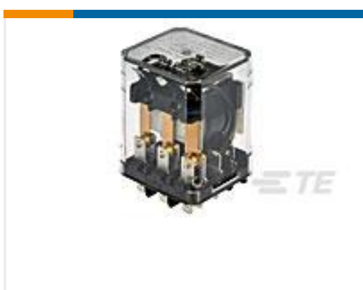
TE Part #2-1393117-3 KUP-11A15-6=KU