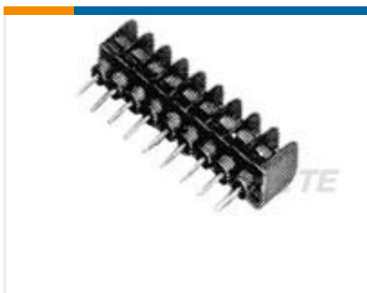
TE Part #2-1437665-0 JC6-P108-02=JC6 ASSEMBLY