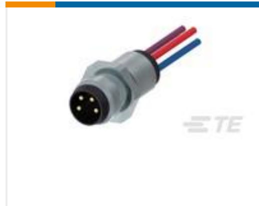
TE Part #2120958-1 M8 MALE SOCKET WITH WIRES, 0.25 SQMM