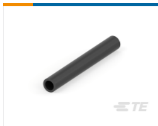
TE Part #NB17372001 RP-4800-NO.2-0-STK