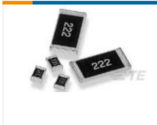
TE Part #1623094-1 CRG0603 ZEROHM