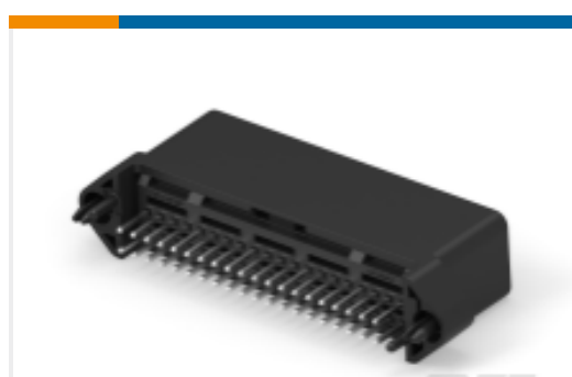
TE Part #3-1379602-1 40W TH HEADER ASSY BLACK