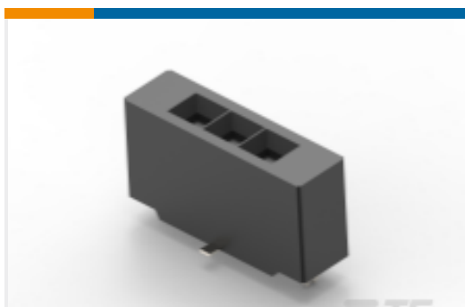
TE Part #5-147731-1 03 MODIV VRT SR SFMNT SN