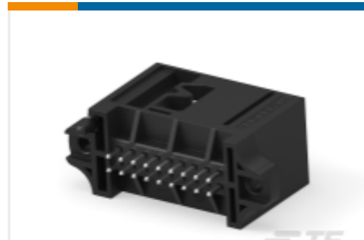
TE Part #2296121-1 18P HEADER ASSY