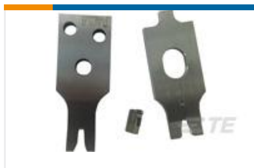
TE Part #7-2151240-7 OCEAN_2.0_SPARE_PART_KIT-055F075F