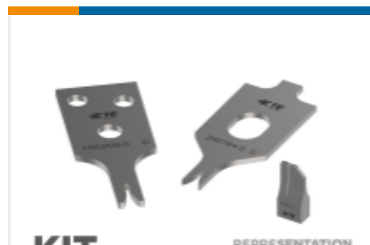
TE Part #7-2836084-7 OCEAN_2.0_SPARE_PART_KIT-091F122F KIT REPRESENTATION ONLY