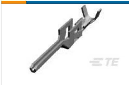
TE Part #1-794613-2 PIN CONT 26-30 30 GOLD L/P