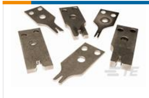
TE Part #1-2119784-5 CRIMPER, INSUL O PREMIUM