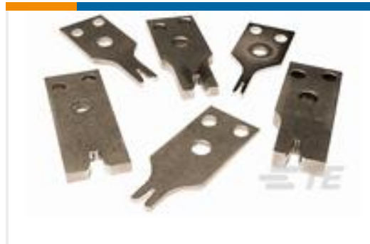
TE Part #2-1633730-7 CRIMPER, WIRE F .042F