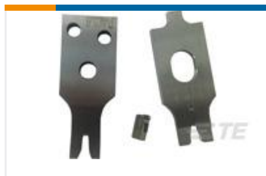
TE Part #7-2266219-7 OCEAN_2.0_SPARE_PART_KIT-046F058F